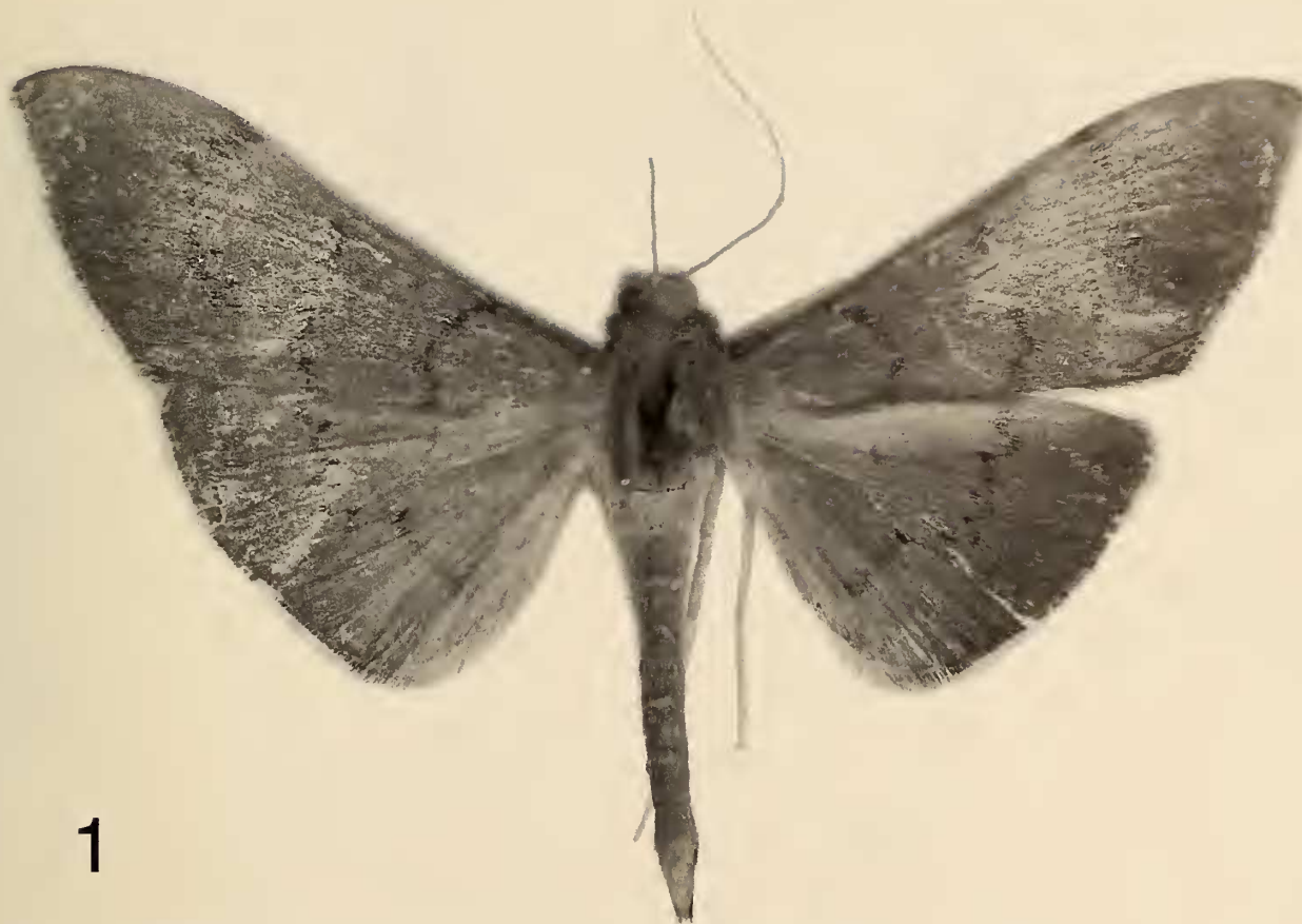
FIG. 1. Paratype adult male of Omiodes pseudocuniculalis , Ecuador, Environs de Loja. Wing length = 16 mm.

spatulate scale, presumably for scent production and/or distribution." ] Female : unknown.